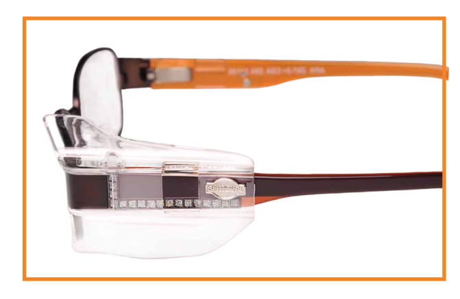
Permanent for Plastic Temples -Riveted