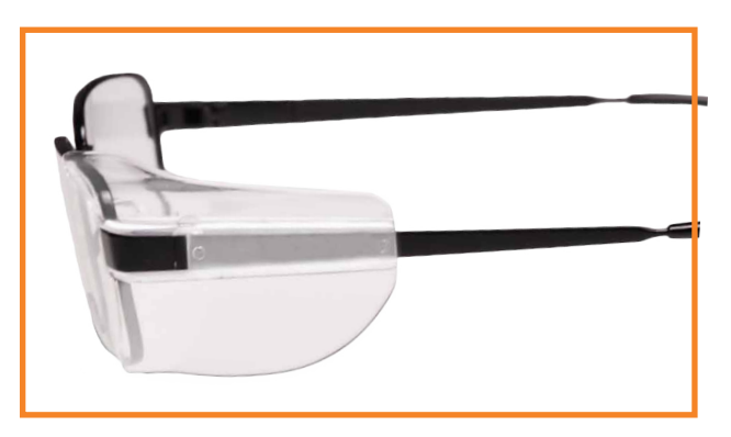
Permanent for Metal Temples - Molded (Side shield is fused to the temple)